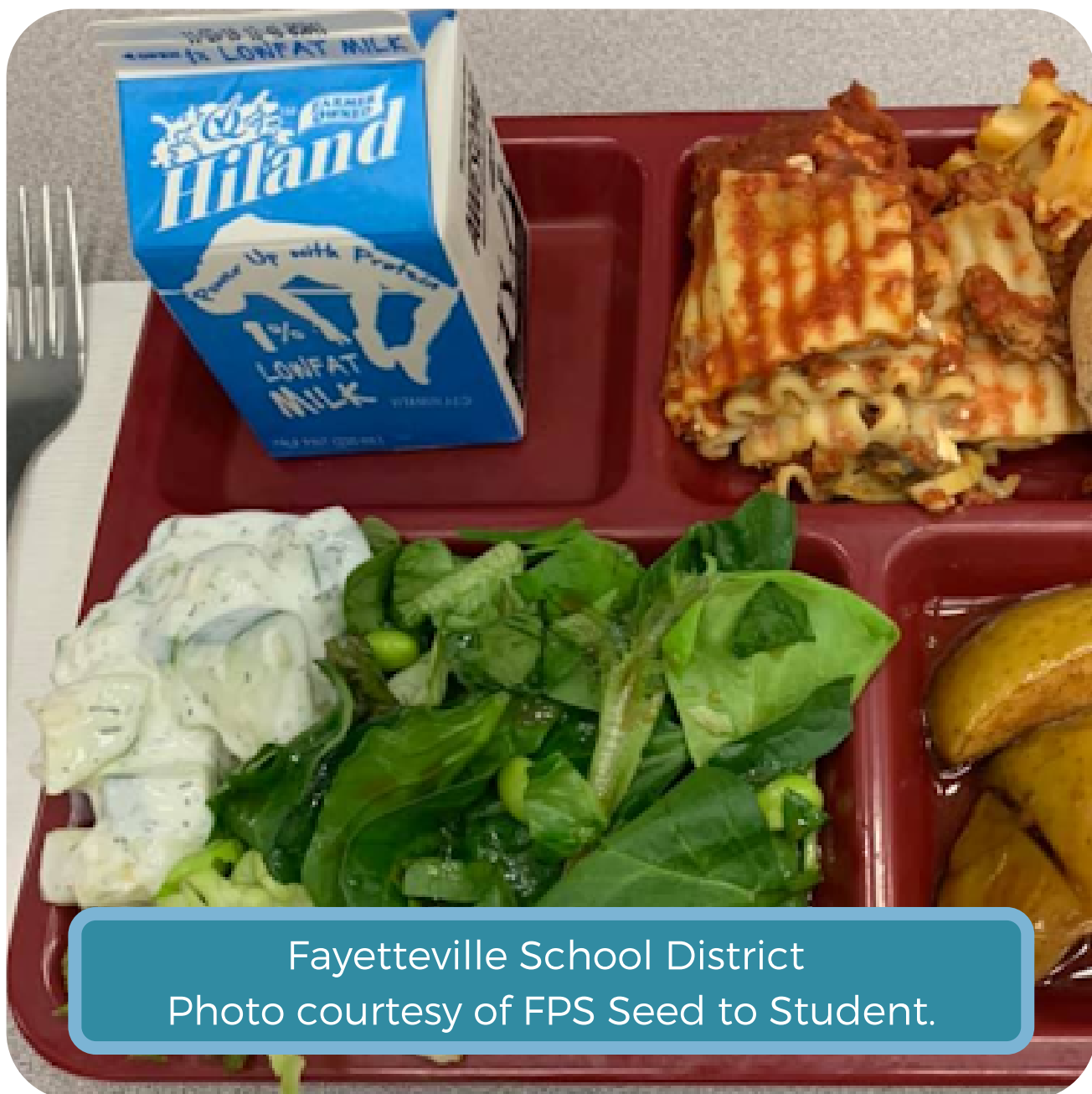
Fayetteville School District

Another way to transform the cafeteria is to include more student voice in the meal experience by allowing the students to create a name for a menu item.