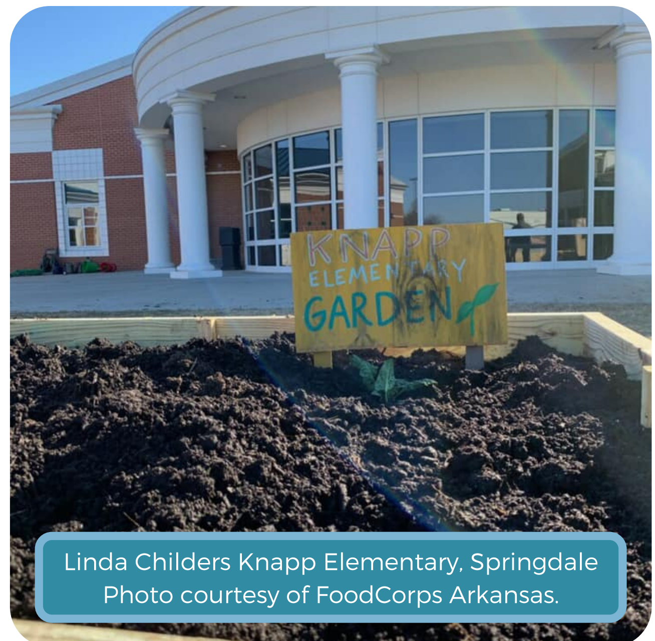
Linda Childers Knapp Elementary, Springdale

Visit our website to learn more and find other ways to participate in the celebration.